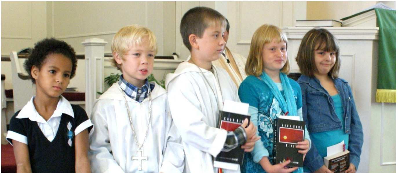
Third graders receive their bibles.