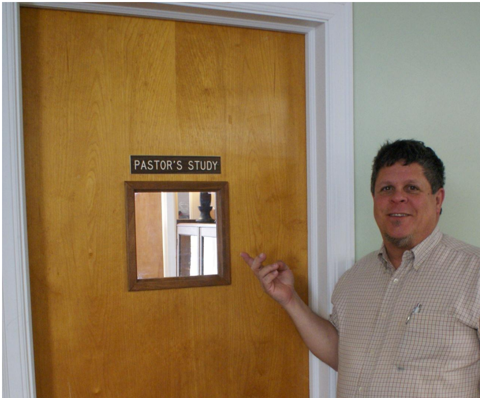
Window installed in Pastor's Study door.